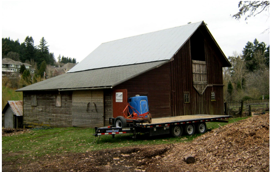
The Shipley-Cook Barn located in Lake Oswego has successfully secured funding to rehabilitate and repair critical structural issues. This National Register-listed barn is a great example of how private dollars and grant funding can be assembled for a pioneer-era barn.

The first step in capturing the historic significance of your barn is to complete a heritage barn survey. This entails describing elements of your barn, from the condition to the floor plan. It is also a way to document your barn for future use and start the process of receiving grants and other forms of funding. A survey form can be found on the State Historic Preservation Office's website and explains the steps to conduct the survey. A survey is not itself a designation, and no regulations are involved in submitting the form.