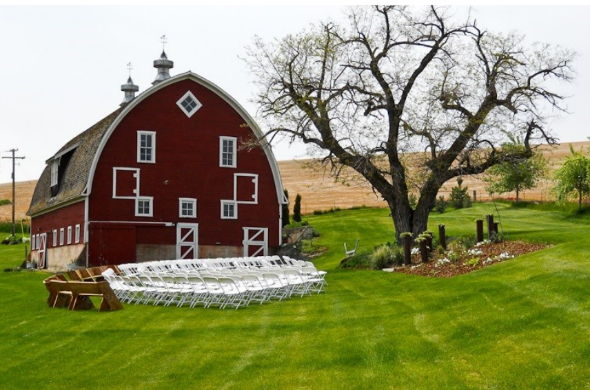
Winn Barn, located in Weston, has been reused as a wedding and other special events venue. It demonstrates one of the more common adapted reuses that a barn can transform into.

Beyond the recognition it confers, National Register listing can help open the door for funding opportunities that can be applied to the restoration of the property. For more information on the National Register and how to list your barn, see Heritage Bulletin #4 provided online by the State Historic Preservation Office.