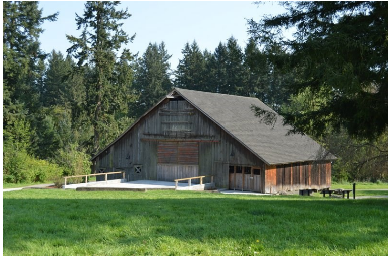
The Stein-Boozier Barn, located in Wilsonville, has been reused by the City's parks department as a community space for weddings, events, and other special activities. Built in 1901, this barn has been updated for accessibility and structural safety