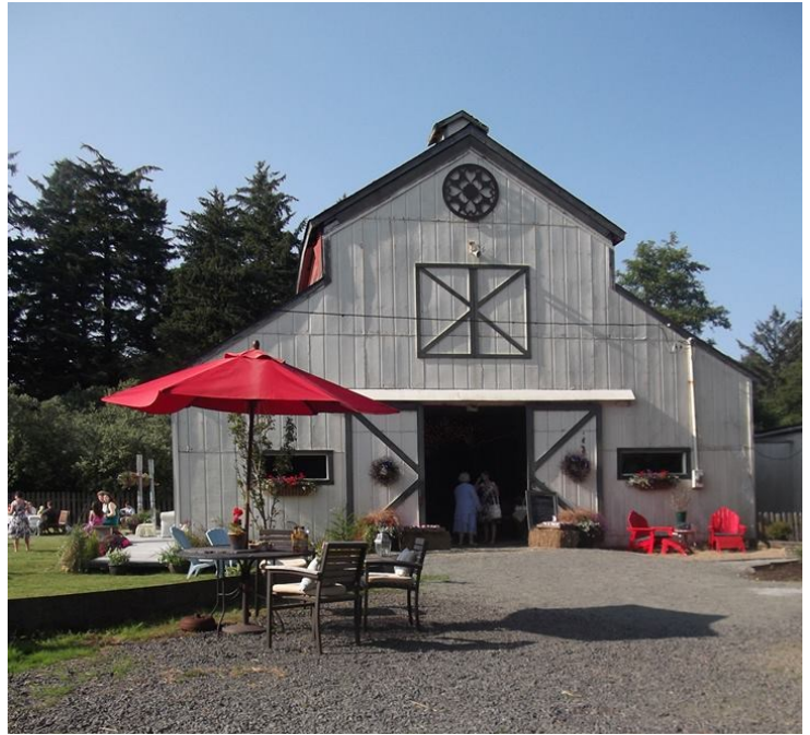
The Neacoxie Barn, located in Gearhart, has been reused as a community space, including learning center and church. It was built in 1890 as the livery stable for the first Hotel Gearhart, and is the last surviving structure of the original commercial development known as Gearhart Park.