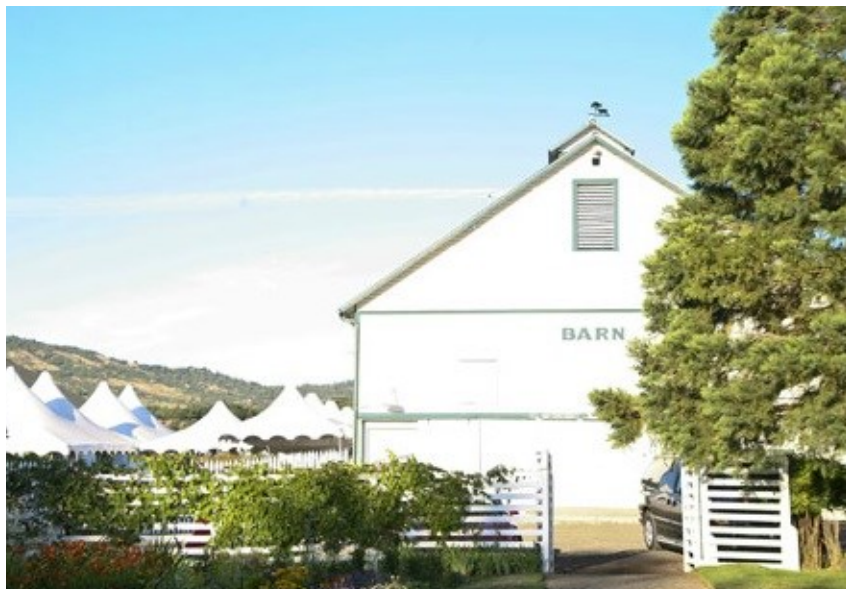
Hillcrest Orchard, located in Medford, has reused their barn for a wine tasting room and special events venue. Built c. 1900, the barn today demonstrates one of the different adapted uses that a barn can transform into.

As utilitarian structures, barns have often been deemed obsolete on modern farms. Because they were built for very specific purposes, barns are frequently difficult to repurpose for today's agricultural operations. There are scarce funding opportunities to rehabilitate barns, and zoning regulations can make reuse options limited. However, Oregon has many opportunities to identify and protect those rural buildings, structures, and landscapes that define the state's agricultural heritage. To help advance the preservation of barns, Restore Oregon has compiled the following resources for use by the property owners that steward the state's agricultural heritage.